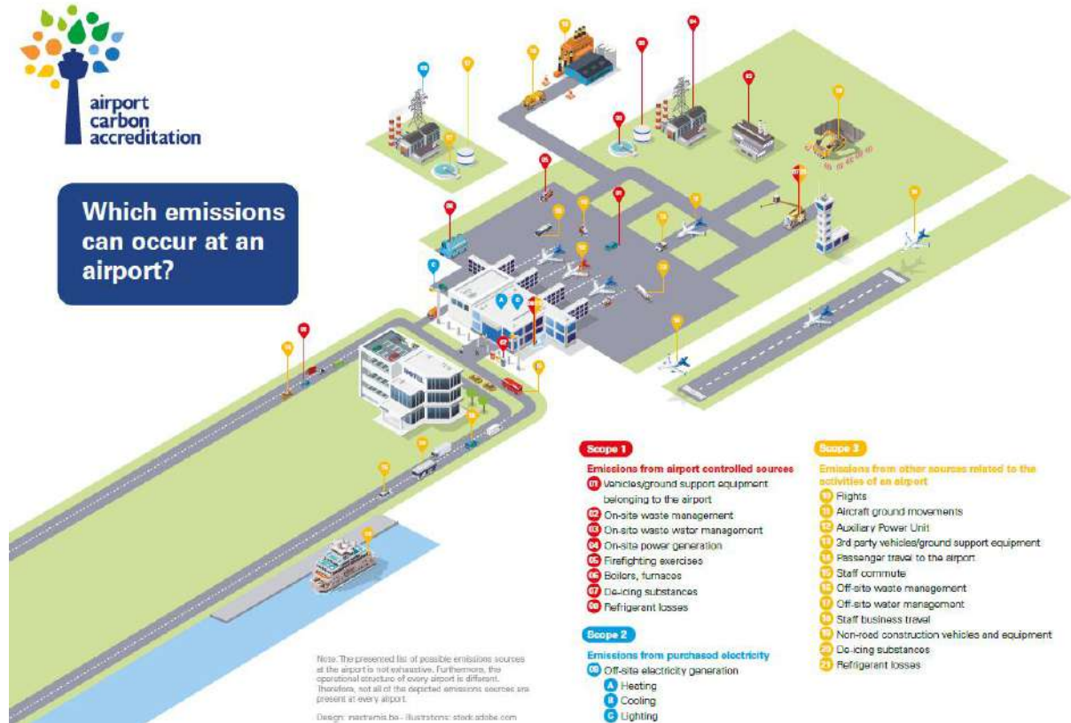
Figure 3 - Overview of Scopes & Emissions

Airports shall submit their carbon footprint data using, or in line with, the worksheets provided by the GHG Protocol, ISO 14064-1, ACI's Airport Carbon and Emissions Reporting Tool (ACERT) or an appropriate combination of these tools. Airports may use different tools and emissions factors that may be more up to date (e.g., emission factors published by the country's relevant authority, emission factors calculated by the airport).