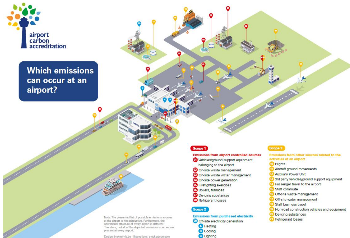
Figure 3 - Overview of Scopes & Emissions

Airports shall submit their carbon footprint data using, or in line with, the worksheets provided by the GHG Protocol, ISO 14064-1, ACI's Airport Carbon and Emissions Reporting Tool (ACERT) or an appropriate combination of these tools. Airports may use different tools and emissions factors that may be more up to date (e.g., emission factors published by the country's relevant authority, emission factors calculated by the airport).